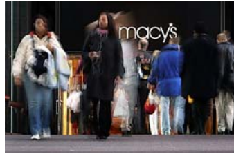
Macy's in Everett, Sears at Alderwood Mall will be...