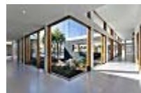
Use Data To Sell Your Home For More (HomeLight)