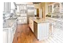
7 Mistakes to Avoid When Hiring a Contractor (HomeAdvisor)