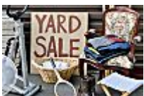
12 Yard Sale Items in the Highest Demand (AARP)