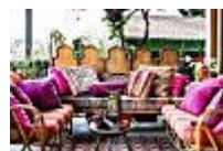
Vintage-Lovers Are Going Crazy Over This New Website (EBTH.com)