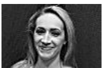
Ever look yourself up? This new site is addicting, enter your (TruthFinder)