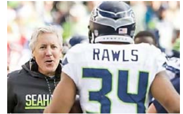
Seahawks to face sixth-seeded Detroit Lions in...