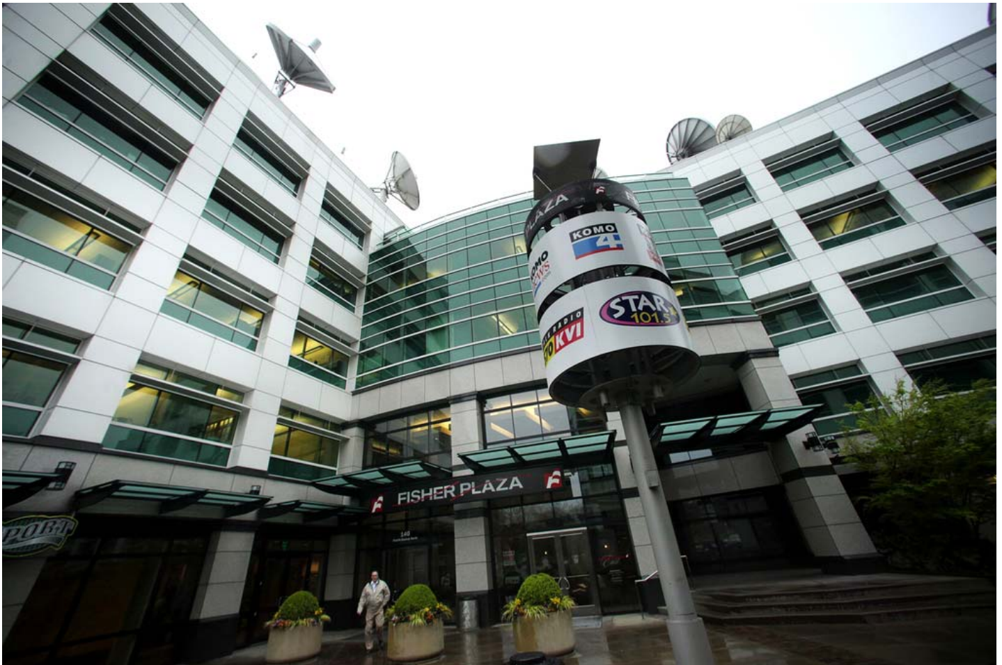
KOMO Plaza, built for former broadcaster Fisher Communications, houses the local ABC affiliate and other communications facilities.