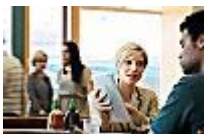
5 Productivity Habits of the Most Successful Salespeople (Salesforce)